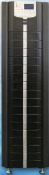
IP33 Series Tower UPS