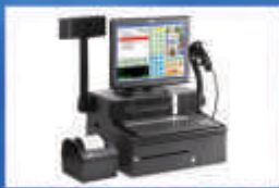
POS and Mission Critical