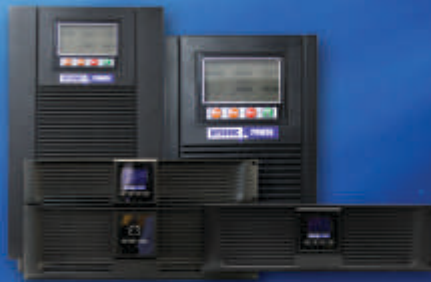
Cloud Based UPS