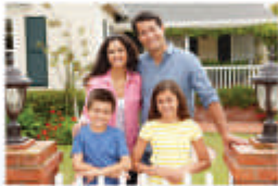
Home / SOHO

Upsonic Power is a wholly Australian owned Company dedicated to providing a solution to guarantee clean reliable power for Domestic, Commercial and Industrial purposes.